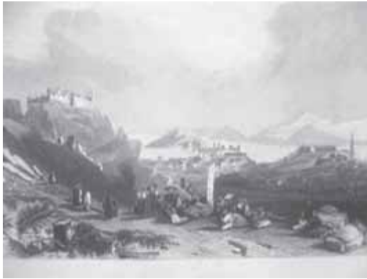
867 CHINA. MACAO. Amsterdam, Gebr. Kraay, ca. 1850. Steelengraving. 15 x 23,5 cm (incl. margins). € 75,00