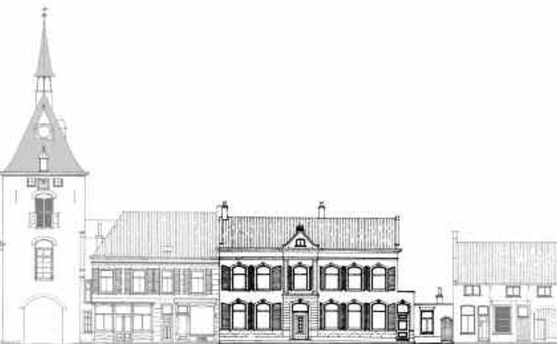
Langendijk 8 - Vianen