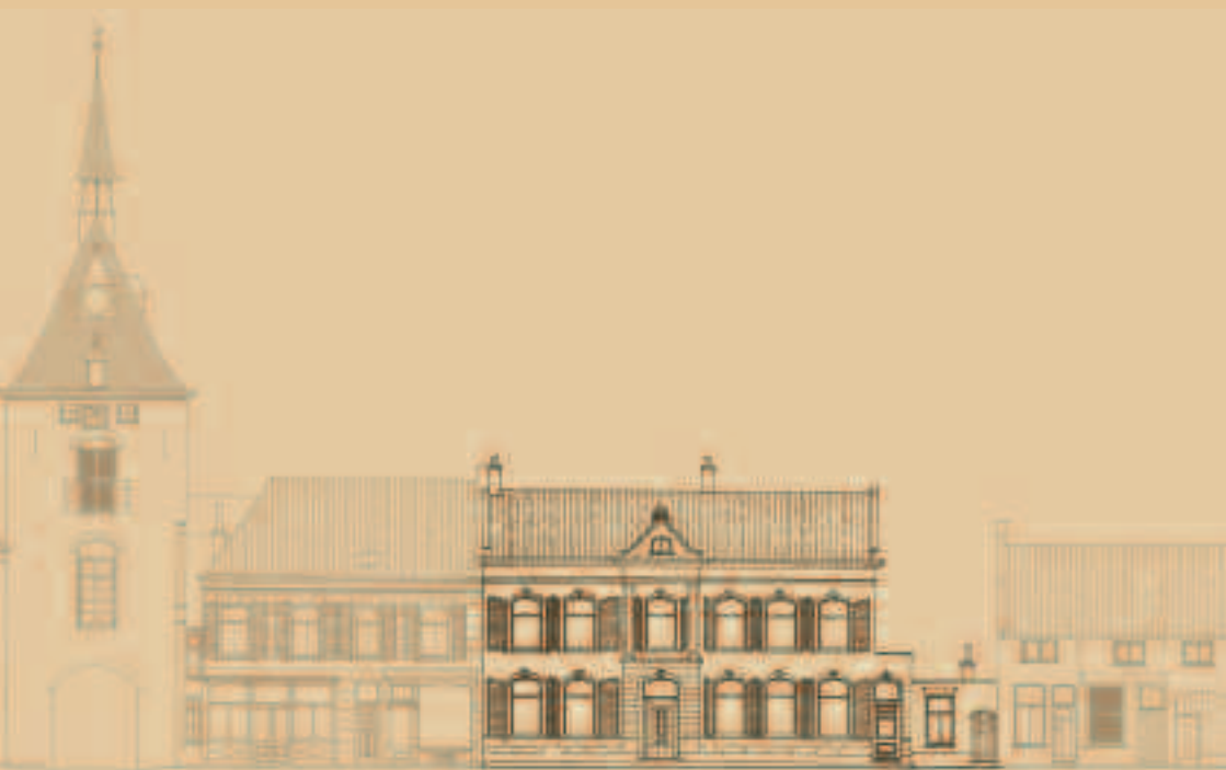
Langendijk 8 - Vianen