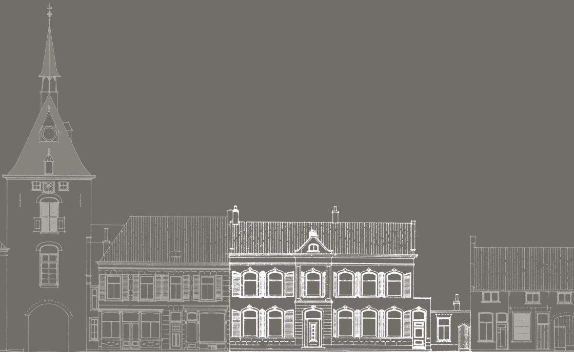
Langendijk 8 - Vianen