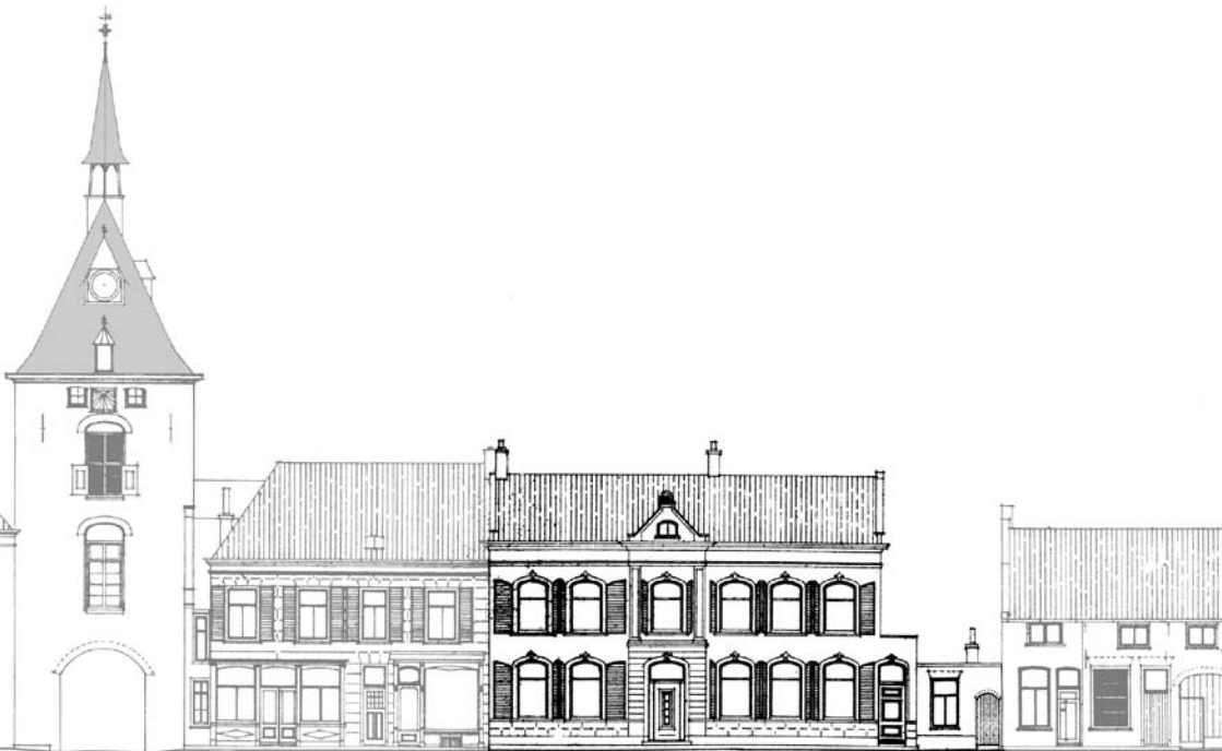
Langendijk 8 - Vianen